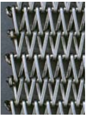
Wrapped & Welded Edge (Pig-Tailed)